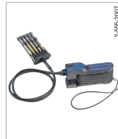
Simultaneous Test Set