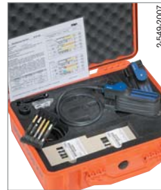
Civil Defense Simultest (CDS) Kit