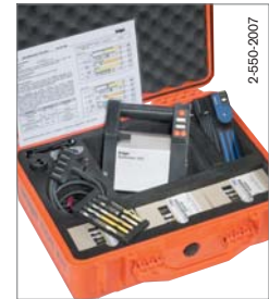
CDS/HazMat Kit with Quantimeter