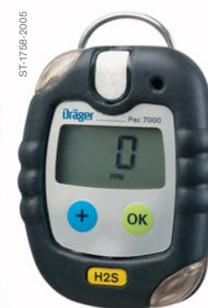
Dräger Pac 7000 Increased functionality and no lifetime limitation.

Visual, vibrating and audible alarms are